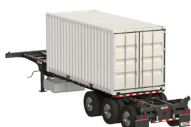
OPENED POSITION 20'