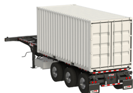
CLOSED POSITION 20'