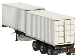
2X 20' POSITION