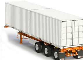
2 X 20' POSITION